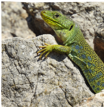
The ocellated Lizard, threatened